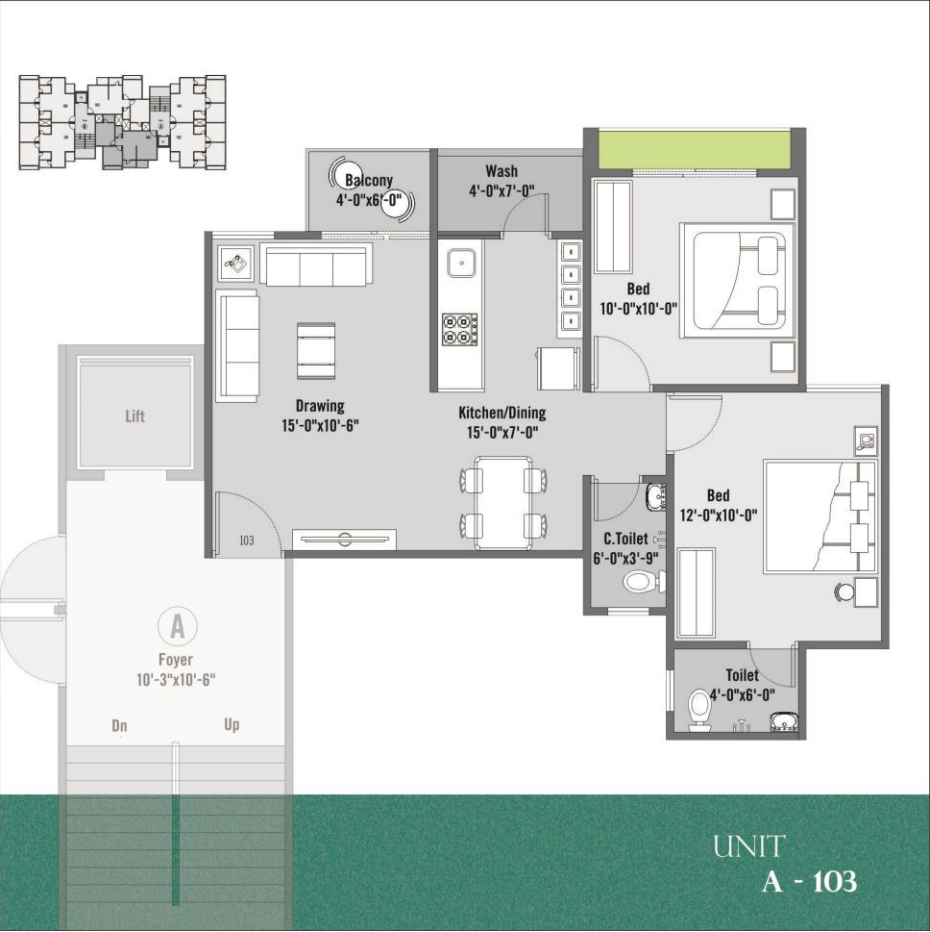
UNIT A - 103